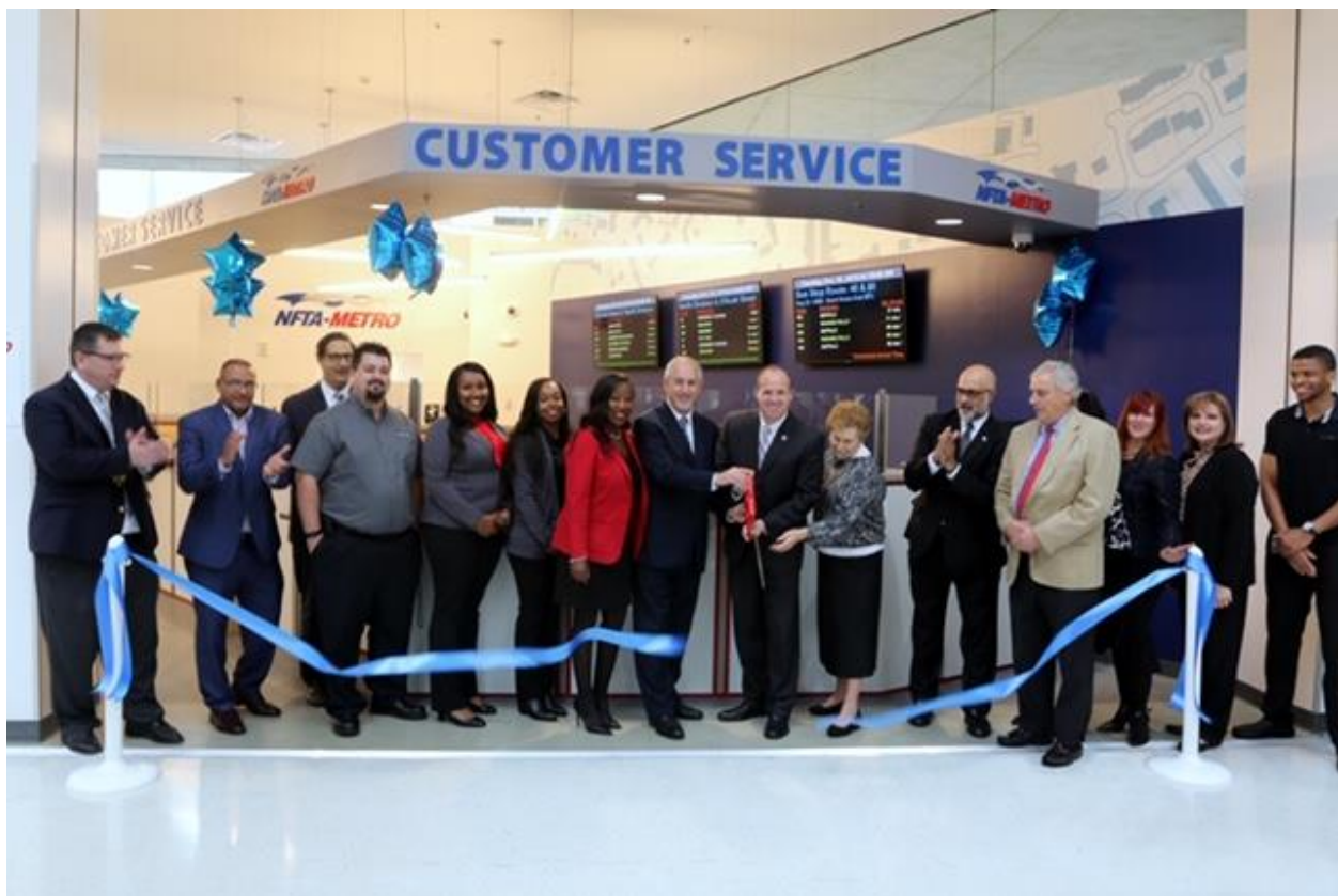
NFTA's new Customer Service Center