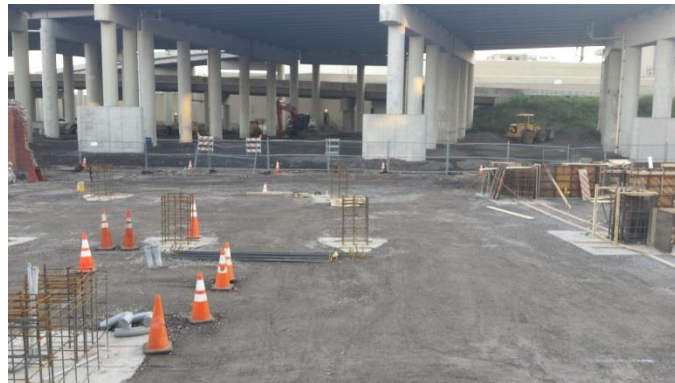
Construction begins at Exchange Street Amtrak Station