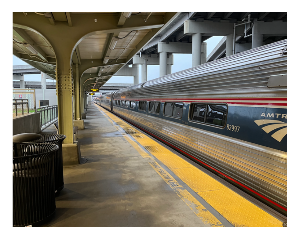
Figure 3. Train leaving Buffalo's new Amtrak Station.