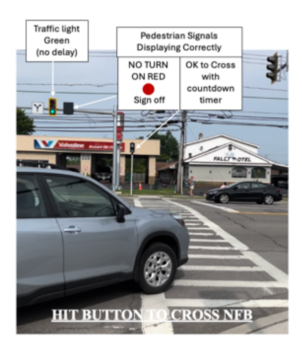
Figure 2. When pedestrian indicate the desire to cross NFB the OK to cross signal illuminates at the same time that the green light for cars turns on.

We are also recommending that the pedestrian crossing signal information be displayed at all times or at least when a pedestrian indicates the desire to cross. Currently pedestrians must wait until the next green cycle that could be up to 2 minutes even if the traffic light is already green.