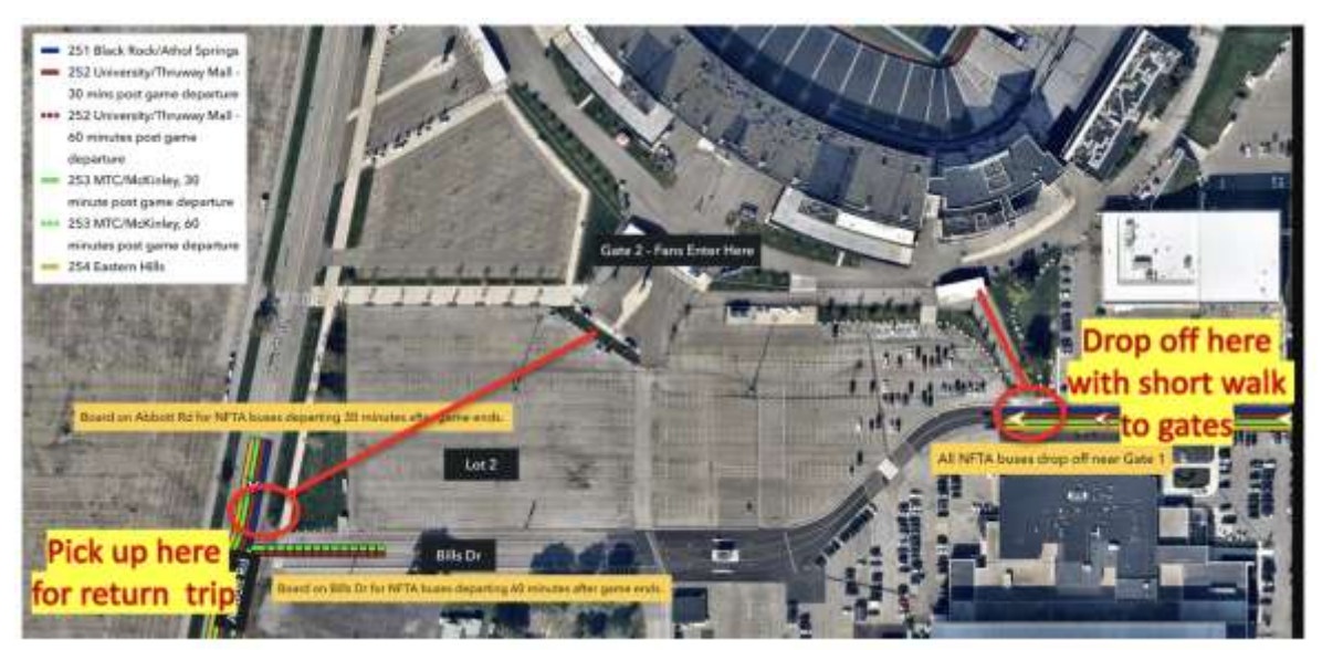
Take the bus and get dropped at the Highmark Stadium door and avoid the driving and parking hassles!

The Bills game express buses connect from 4 locations, the Black Rock Riverside Transit Hub, the University Station bus loop, the Metropolitan Transportation Center in downtown Buffalo, and the McKinley Mall Transportation Center. Buses are scheduled for those who want to arrive early and those who just want to be on time for kickoff. Return buses are scheduled for 30 and 60 minutes after the game. The cost is $5 per person, per trip ($10 round trip), same as other NFTA express buses. Fares for those working at games are paid by the Buffalo Bills. If demand exceeds bus capacity, the NFTA will provide a second bus.