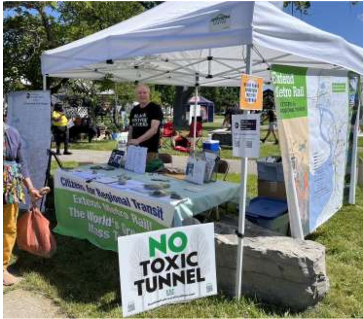
Tabled at Juneteenth