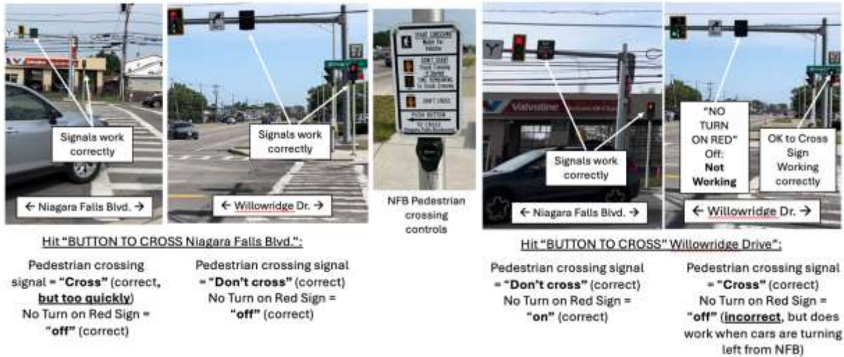
Figure 2. Pedestrian crossing signals are working along Niagara Falls Blvd. but need some improvements.

Pedestrian crossing signals are now working at NFB and Willowridge Drive. They work well except for a few problems summarized in the figure below. In addition to these operational problems, we are calling for a delay in the green signal for cars turning right off Willowridge Drive when pedestrians are crossing. The way it is now, cars turning right onto NFB are looking left to see if anyone is running the light at the same time pedestrians are told it's OK to cross. This is unsafe.