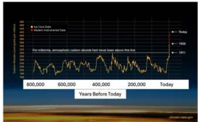
Figure 1. The last 10 years have seen the highest global temperatures in history ( https://climate.nasa.gov/vital-signs/global-temperature/?intent=121 ). CO 2 levels are rising exponentially due to human activity ( https://science.nasa.gov/climate-change/evidence/ ).

Mitigating Actions Have Been Promised. Our political and government leaders have passed legislation and established government guidelines to address the climate issue. (References 5-8.) The voters of NY even passed an Amendment to the NYS Constitution (by a 2 to one margin) that says: "each person shall have a right to clean air and water, and a healthful environment." But Governors change and agencies like NYS Department of Transportation (NYSDOT) don't respect and don't follow the new laws and guidelines. A prime example is the NYSDOT Kensington Expressway Project. Its Design Document / Environmental Assessment (DD/EA) says that the plan is "consistent with" the Climate Leadership and Community Protection (CLCPA) law because CO 2 is reduced by 0.04% by 2047. But the CLCPA requires 40% reduction by 2030 and 85% by 2050. The NYSDOT DD/EA Report also admits that particulate pollution near the portals goes up by 6%.