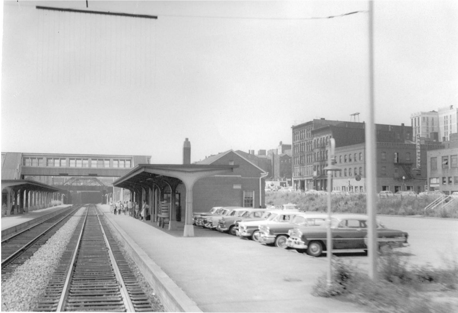
BUFFALO EXCHANGE ST. - AUGUST 1956