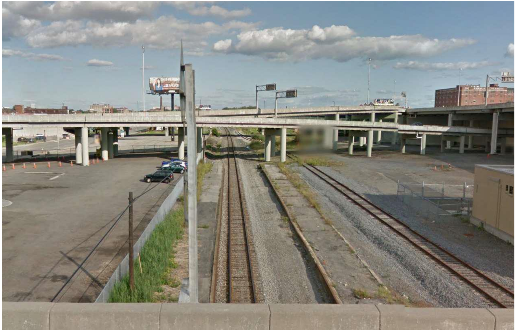
View looking east from the current station site with the main service track in center. Note remnants of a former platform to the right.